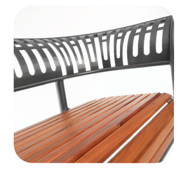
+ WOOD AND POLYMERS